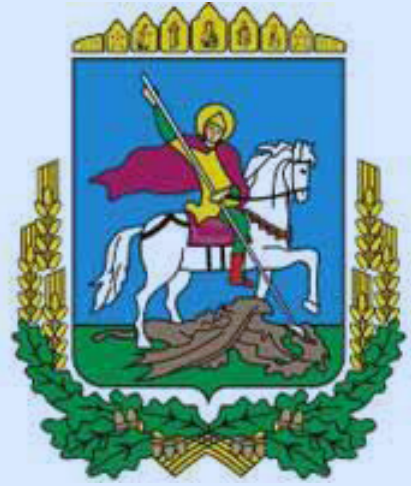
KYIV REGIONAL MILITARY ADMINISTRATION