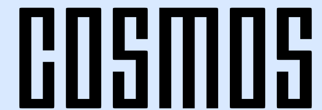
DESIGN & DEVELOPMENT STUDIO