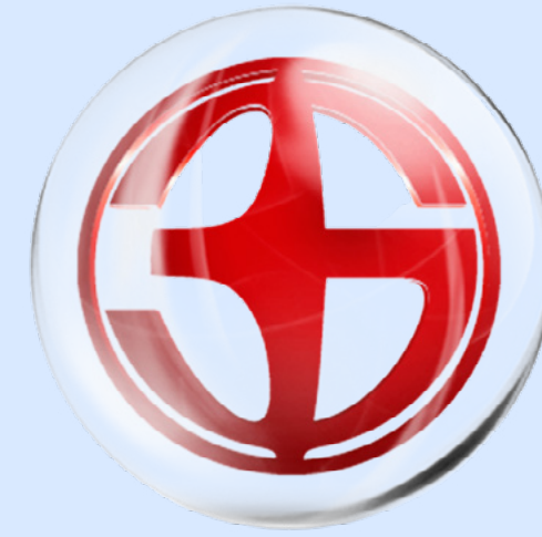
BORSHCHAHIVSKIY CHEMICAL AND PHARMACEUTICAL PLANT